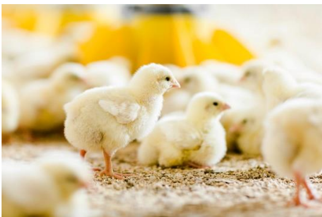
Caption: Biostrong® Fertile supports efficiency in production of day-old chicks.