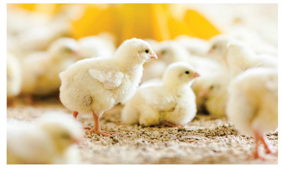
Biostrong Fertile supports efficiency in the production of day-old chicks.

Improving male fertility is the most efficient way to strengthen the production of day-old chicks.