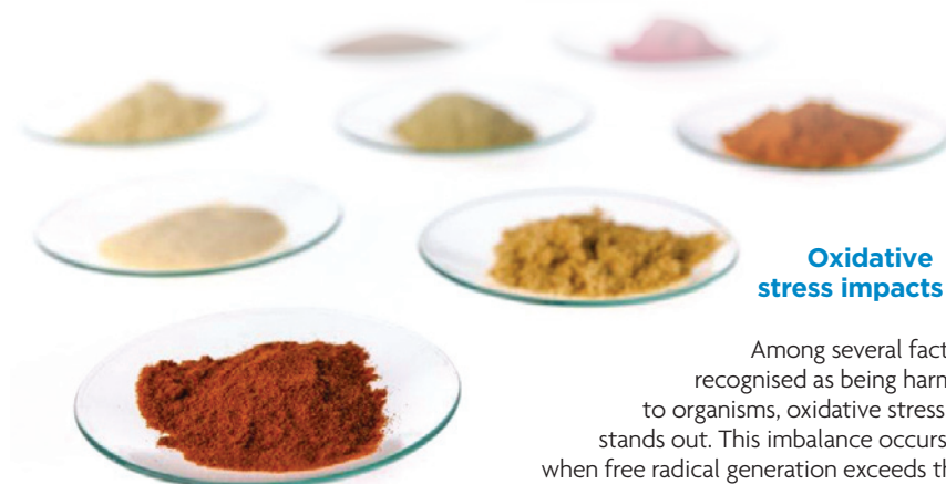
Oxidative stress impacts

In the case of male poultry, this ability